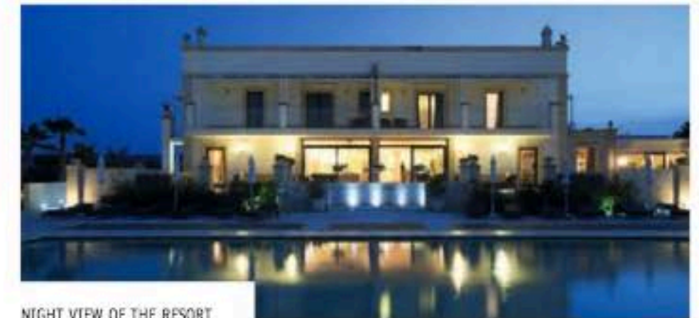
NIGHT VIEW OF THE RESORT

A refined boutique hotel overlooking the sea of Torre Canne, in the heart of Puglia, inside the Regional Nature Park, Dune Costiere. This is Canne Bianche Lifestyle&Hotel. Harkening back to the style of the ancient whitewashed farmhouses, with its timeless charm and the values of respect and care for the land and its guests. The soft colours, artisan furnishings, local artistic ceramics, authentic kindness and warm smiles of