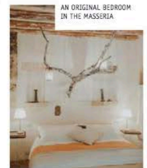
AN ORIGINAL BEDROOM IN THE MASSERIA

from old shutters, primitive farming implements transforming themselves into pieces of furnishing. "La Falegnameria" restaurant - similar to a real carpenter's workshop, with tins of paint and tables in unfinished wood - is the place to discover the authentic flavours of Puglia cooking with products grown a 0 km in the Masseria's organic kitchen garden. Guests can sip a drink or read a good book in the winter garden, amongst wrought iron decorations, vintage armchairs and damask sofas to settle down by the fire burning in the